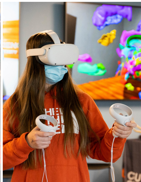
VIRTUAL REALITY EXPERIENCE